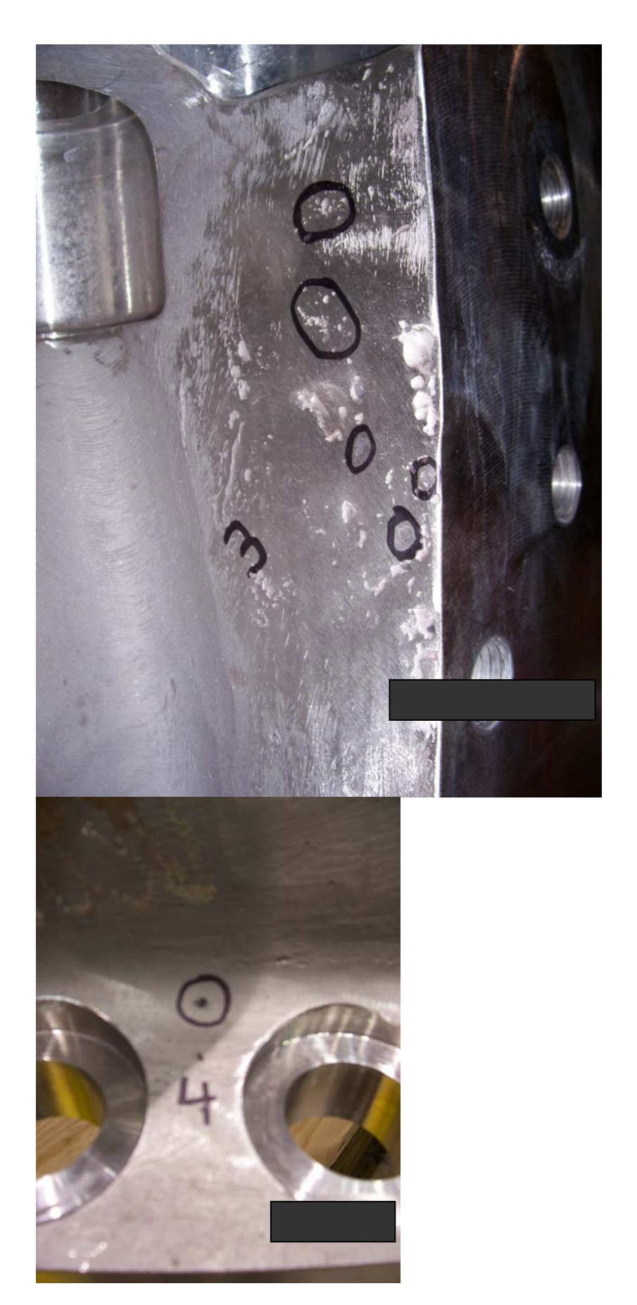
Page 2 of 4