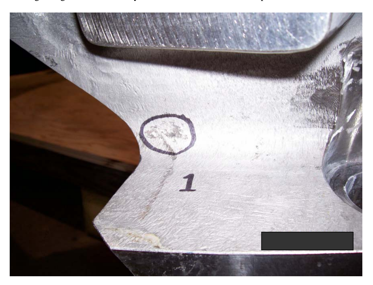
A4 High Magnetic Permeability Areas and Lead Block Slot Lip NCR 11/30/06