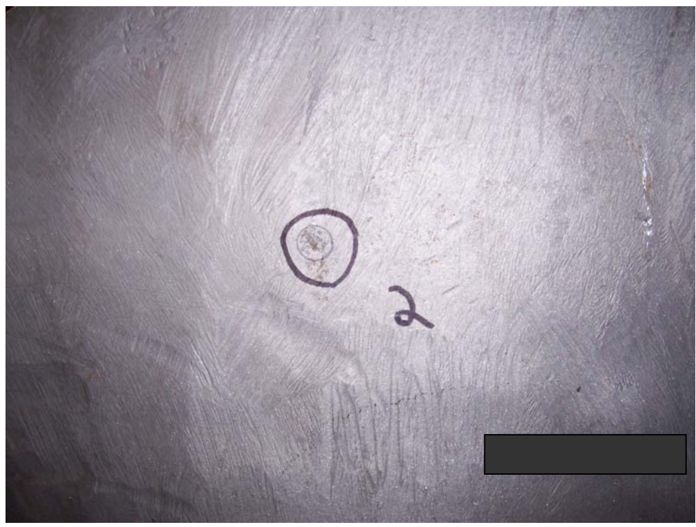
Page 1 of 4