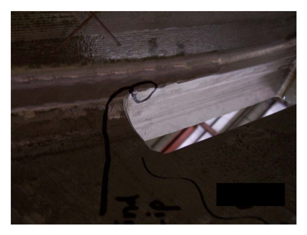
Page 4 of 4