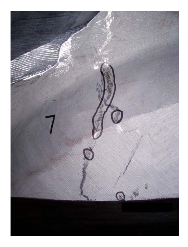
Lead Block Slot Lip