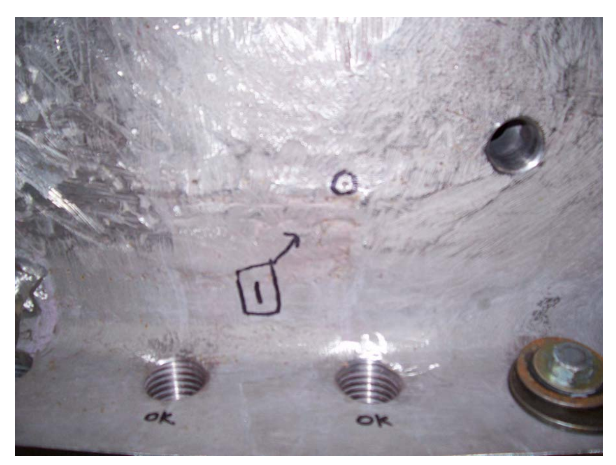
MCWF A5 High Permeability Areas NCR # 3701 3/8/07