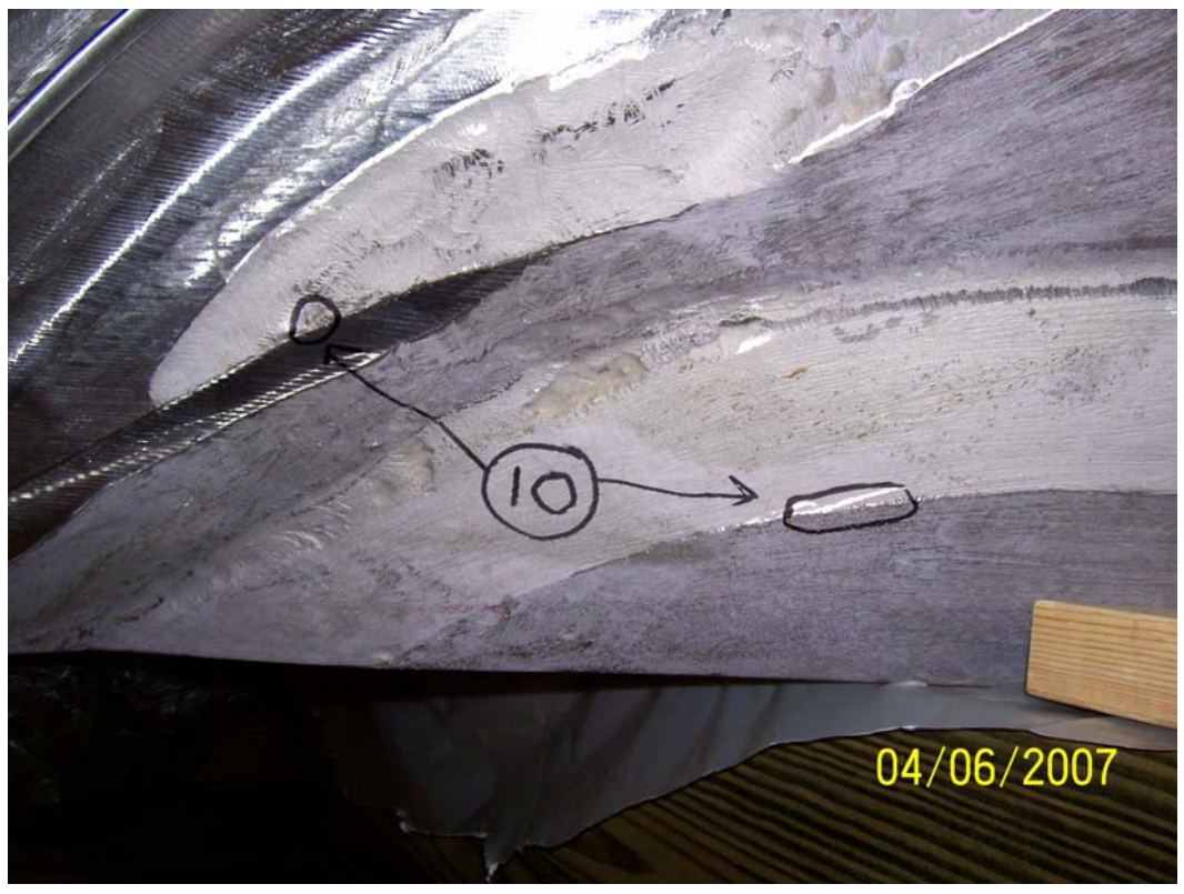
Page 5 of 6