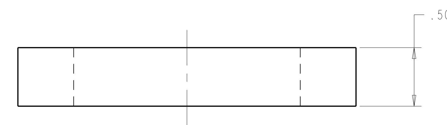
-1 WASHER SCALE 2.000

RELEASED FOR FABRICATION / INSTALLATION PPPL Drafting: