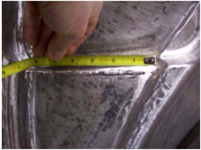
Indication after informal penetrant testing.