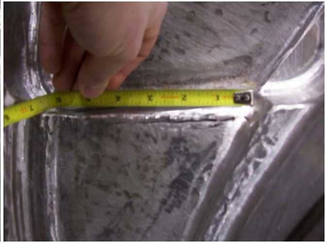
Indication after informal penetrant testing.