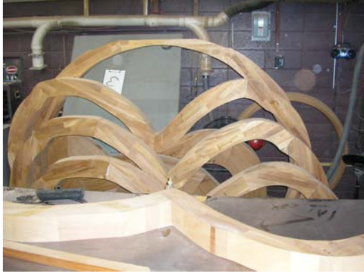
Rough Stock Drag Box Core Print