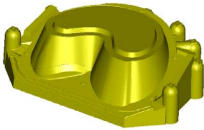
Front View Drag Pattern

The modeling for Coil A is progressing. Don estimates that he is near half way through developing the models. .