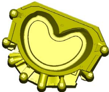
Top View Drag Pattern