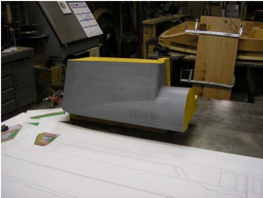
Loose Piece Core Box