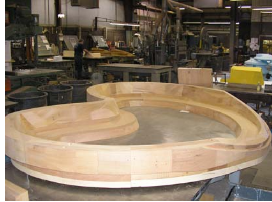
Layers 1 & 2 Drag Box Core Print