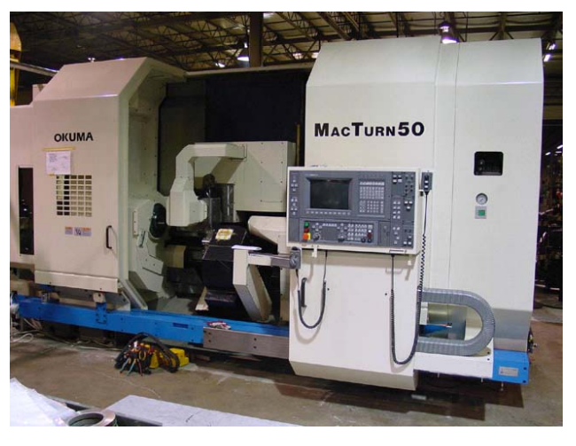
The Major Difference in Fabricating and Machining