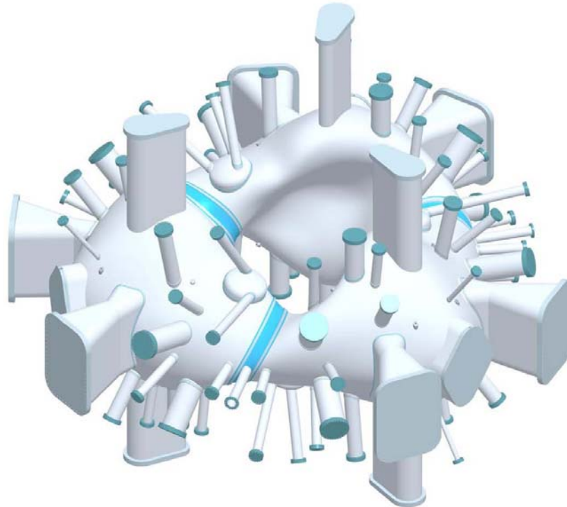
Figure 2 - NCSX with all components removed except the vacuum vessel and its ports