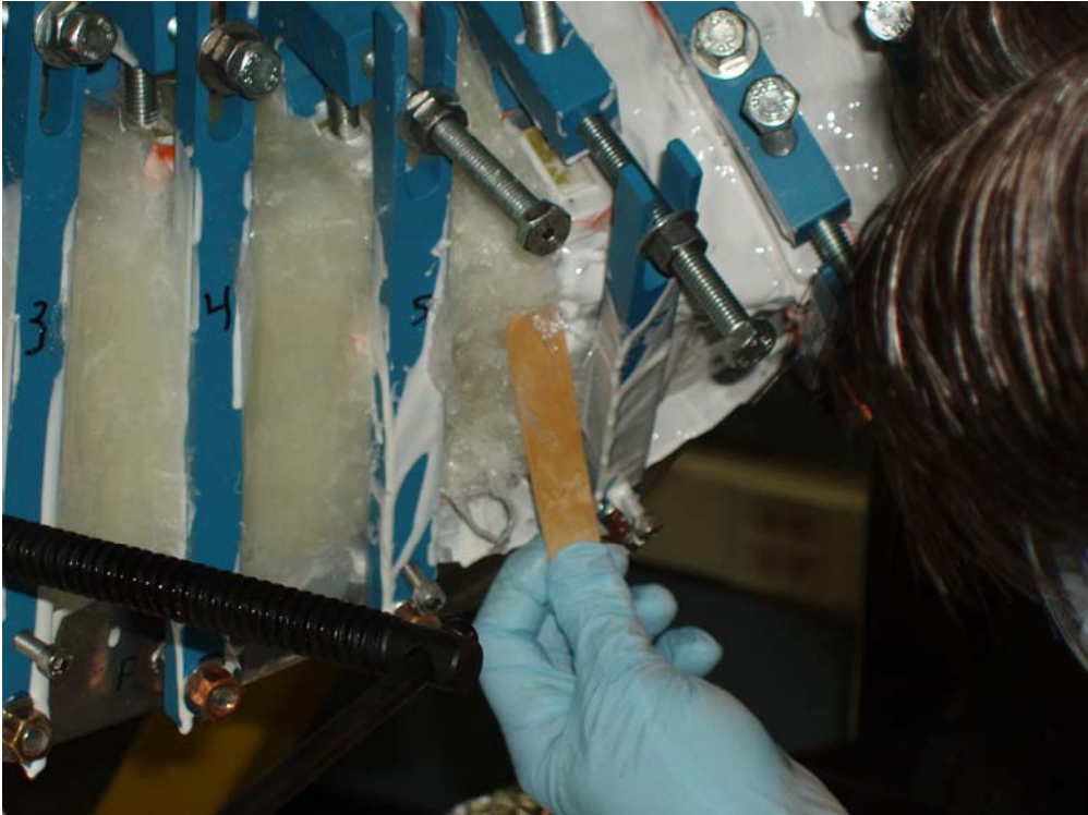
Applying Epoxy/Glass Shell