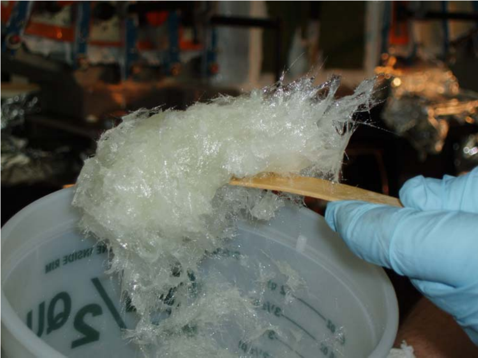
Hysol and Glass Fiber Mix