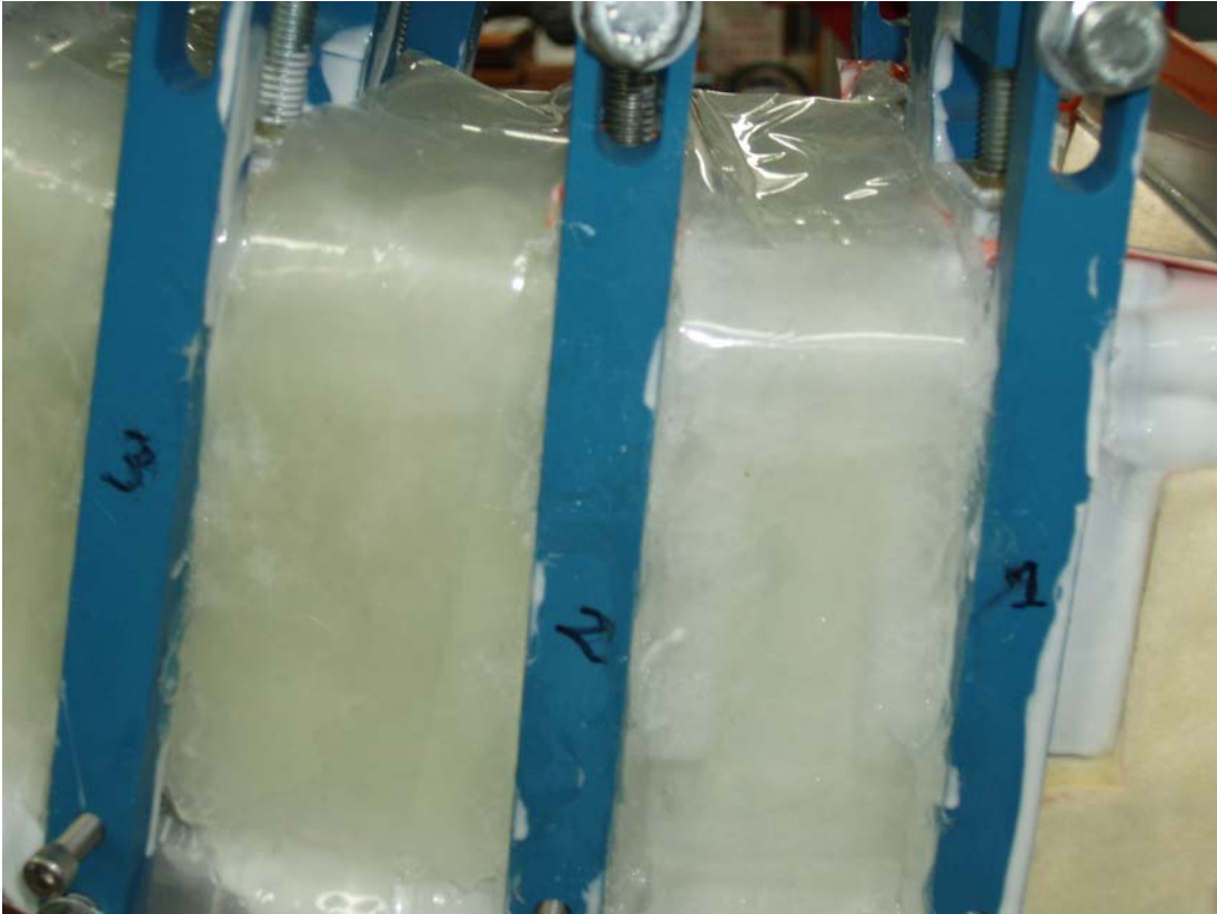
Epoxy/Glass Bag Shell