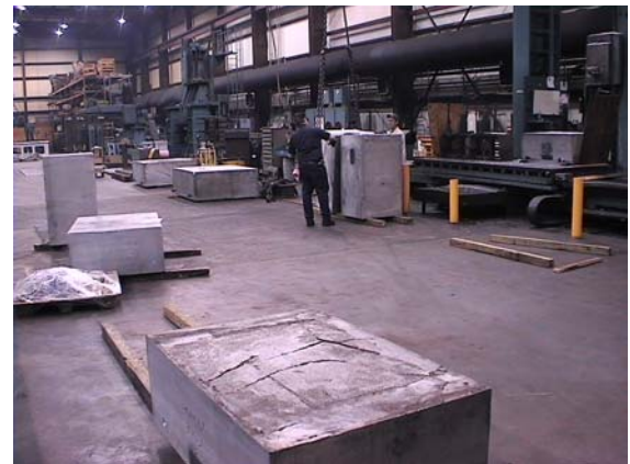
15 Blocks of Kirksite at MTM