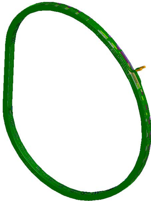
Fig. 3.1.1-1. NCSX Toroidal Field Coil Details